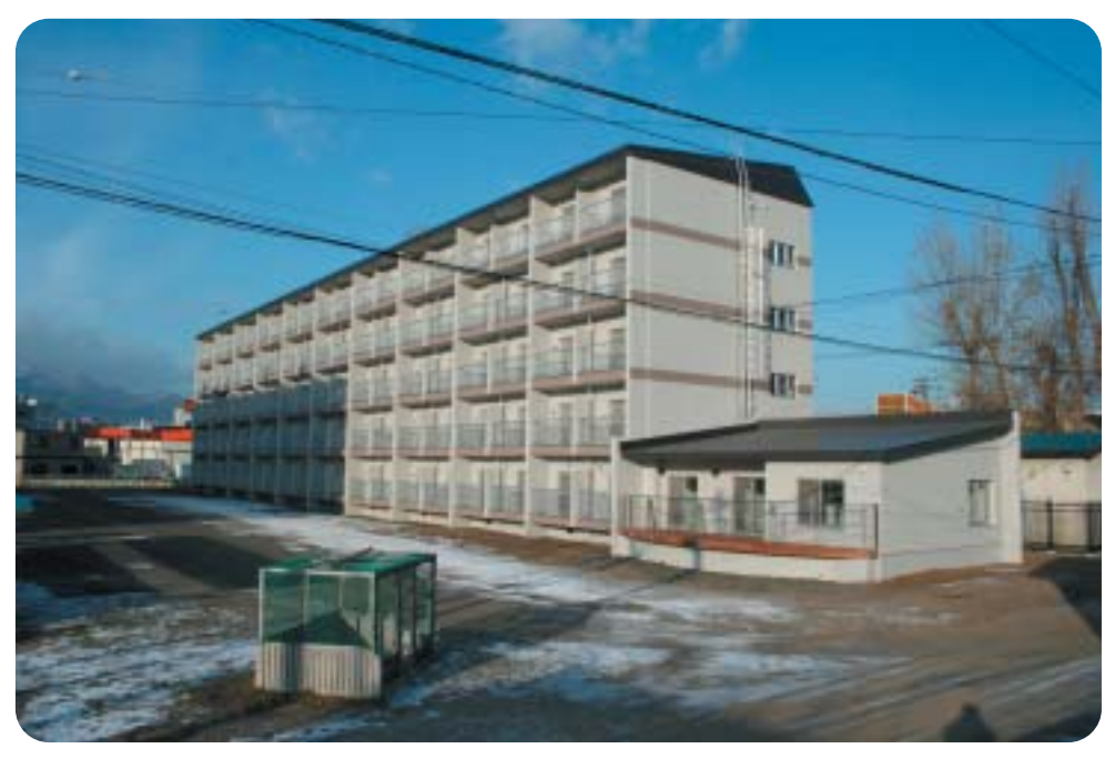
Minamishinkawa International Residence

With the completion of this residence, Hokkaido University now has a total of 246 rooms for overseas students. Since Hokkaido University is committed to the continued promotion of international exchanges, it intends to further increase and improve housing for international students.