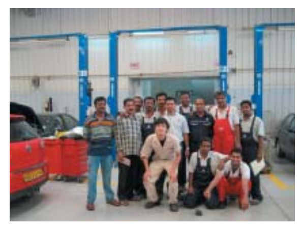
CEED: overseas internship (at an automobile repair shop in Oman)

Last year, approximately 80 students participated in the internship program and worked at businesses and universities at home and abroad. A recent survey revealed that internship helps