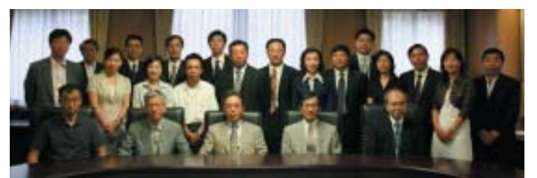
Closing Ceremony of the Waste Treatment Training for Henan Province, China

It is Hokkaido University's expectation that this training course will be utilized for activities to solve waste problems in Henan Province in the future.