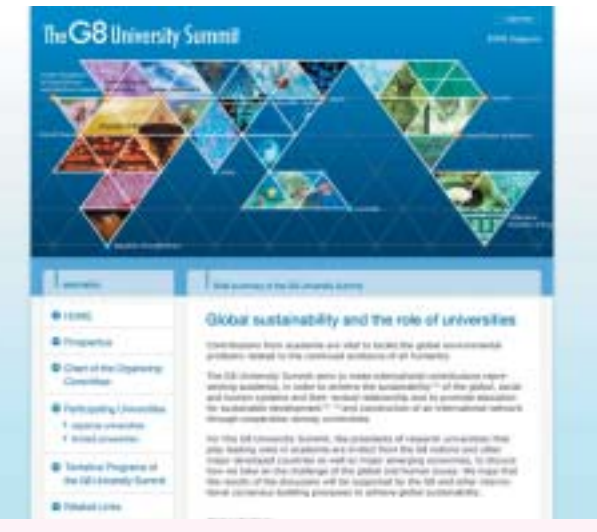
Website of the G8 University Summit