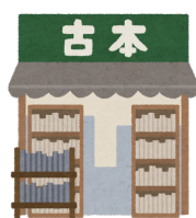
a secondhand bookstore