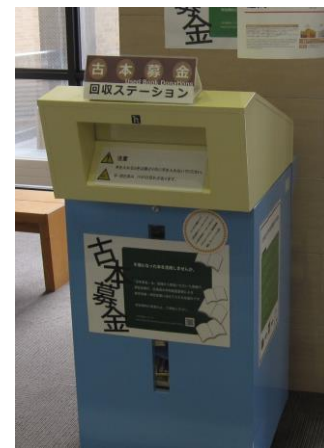
A donation station