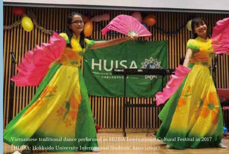
Vietnamese traditional dance performed in HUISA International Cultural Festival in 2017 (HUISA: Hokkaido University International Students' Association)