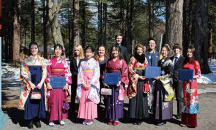
Graduation Picture of Class of 2020