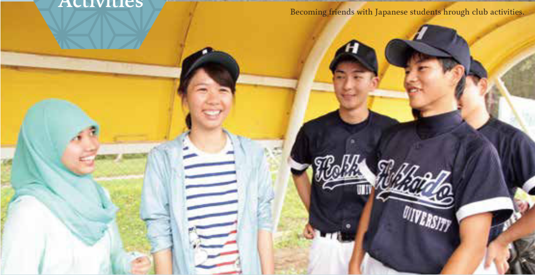
Becoming friends with Japanese students through club activities.

With over 250 university clubs and societies to join, there will be something to suit everyone's interest. Join one of the teams that dances in the Yosakoi Soran Festival, play in the university orchestra, go skiing in Niseko or learn a Japanese martial art. You will find that joining a club is a fascinating insight into Japanese life and culture, as well as a great place to make Japanese friends.