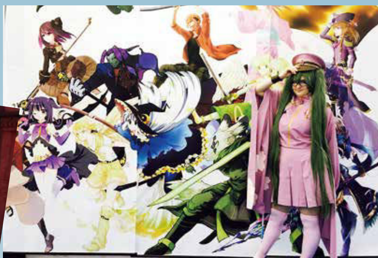
Learning about pop culture event management at the Toyoko Manga Anime Festa .