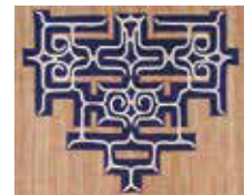
© Rumiko Fujitani, 2013. Traditional Ainu pattern for Attus clothing.