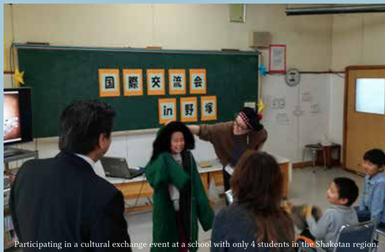
Participating in a cultural exchange event at a school with only 4 students in the Shakotan region.