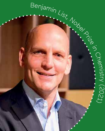
Benjamin List, Nobel Prize in Chemistry (2021)