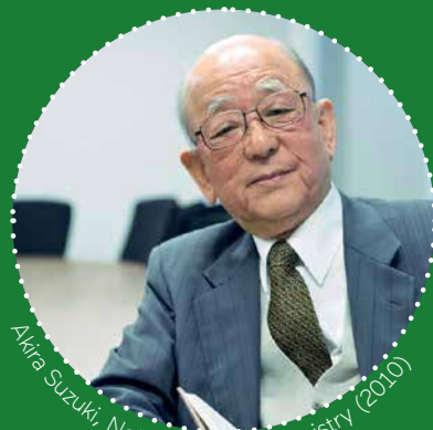
Akira Suzuki, Nobel Prize in Chemistry (2010)