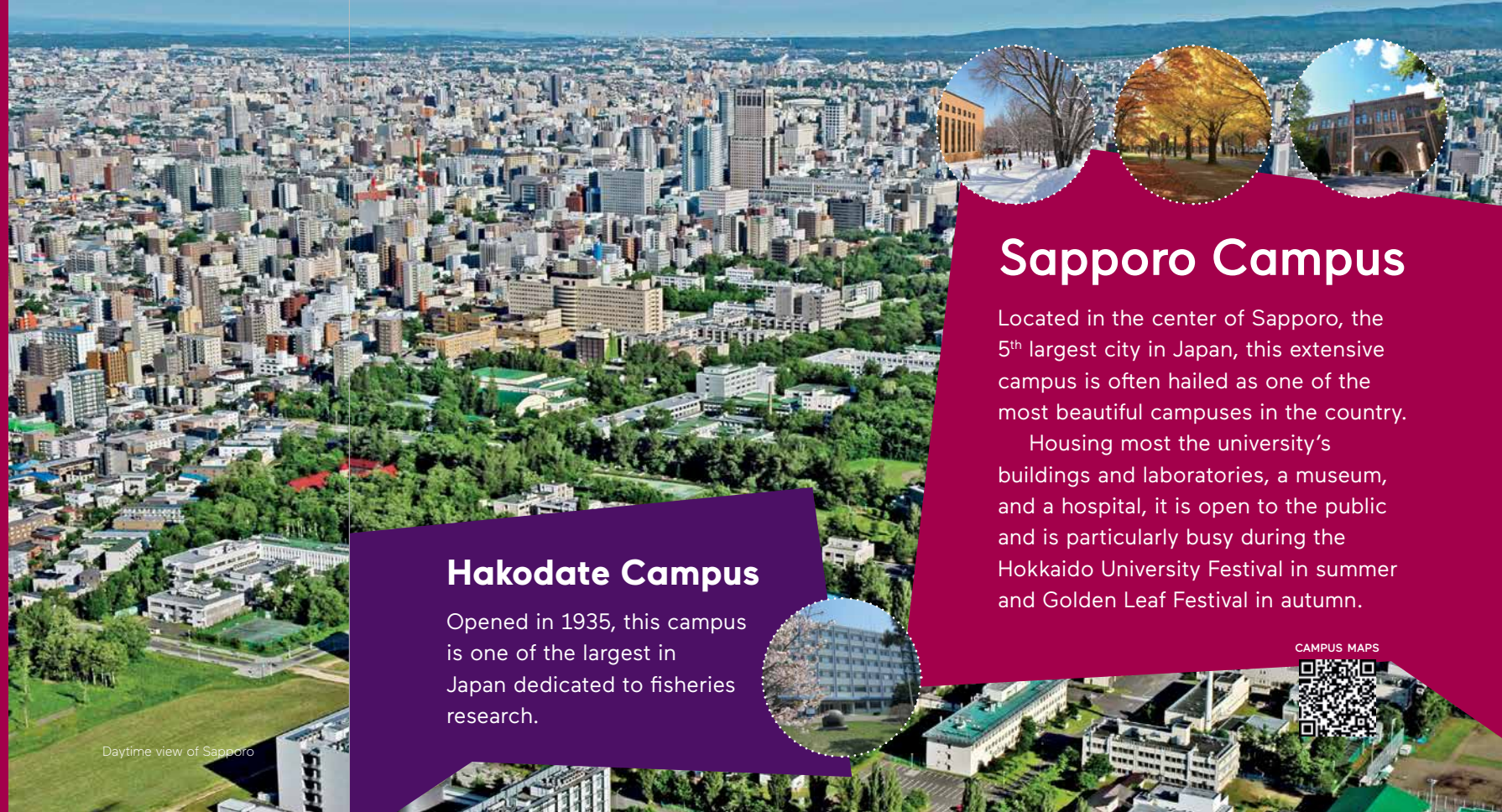
Daytime view of Sapporo