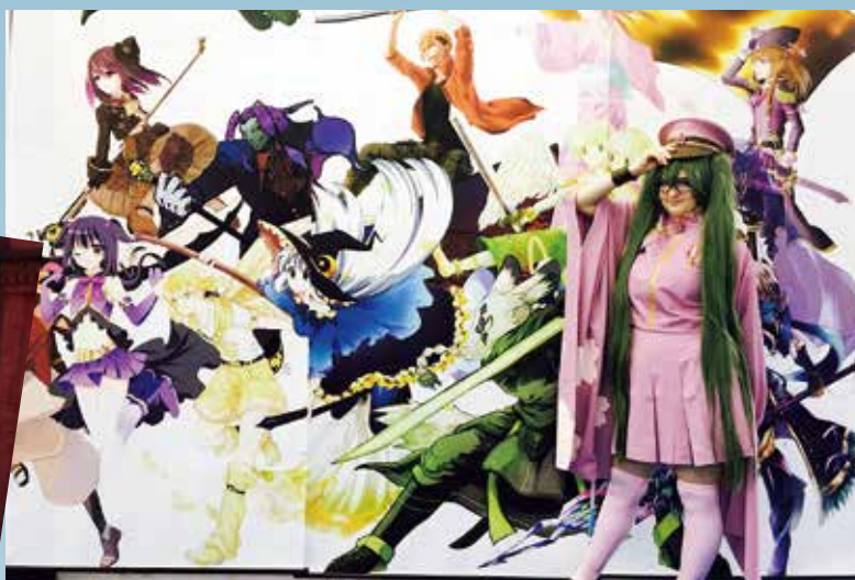
Learning about pop culture event management at the Toyoko Manga Anime Festa .