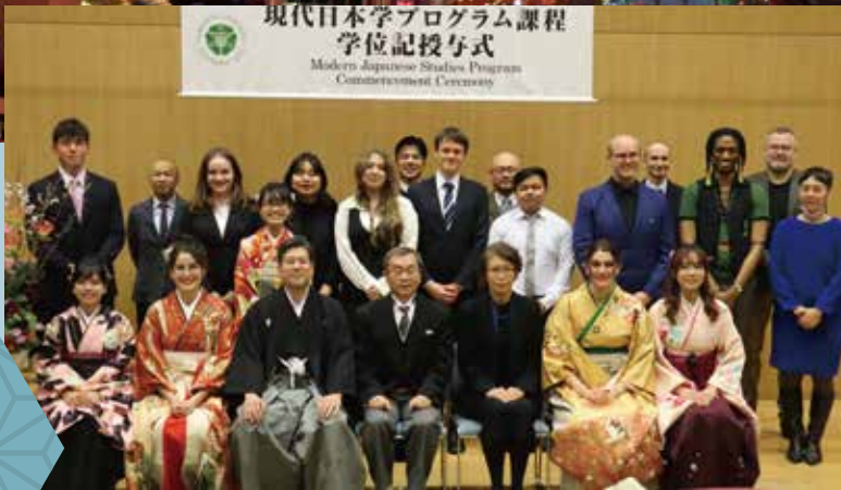
Graduation Picture of Class of 2020