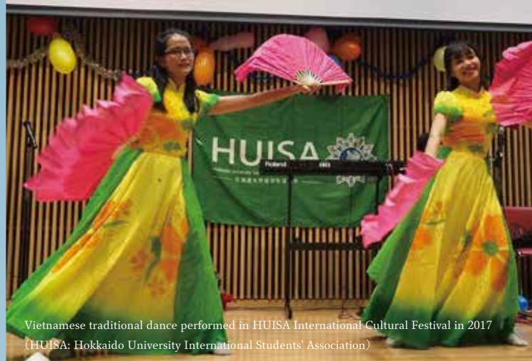
Vietnamese traditional dance performed in HUISA International Cultural Festival in 2017 (HUISA: Hokkaido University International Students' Association)