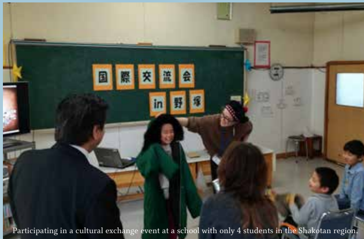
Participating in a cultural exchange event at a school with only 4 students in the Shakotan region.