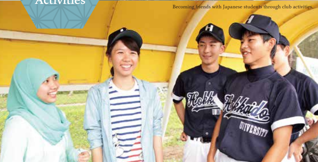
Becoming friends with Japanese students through club activities.

With over 250 university clubs and societies to join, there will be something to suit everyone's interest. Join one of the teams that dances in the Yosakoi Soran Festival, play in the university orchestra, go skiing in Niseko or learn a Japanese martial art. You will find that joining a club is a fascinating insight into Japanese life and culture, as well as a great place to make Japanese friends.