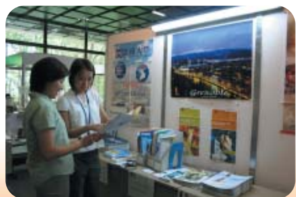
▲Partner university introduction corner