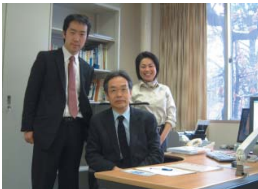
▲Members of HUISD