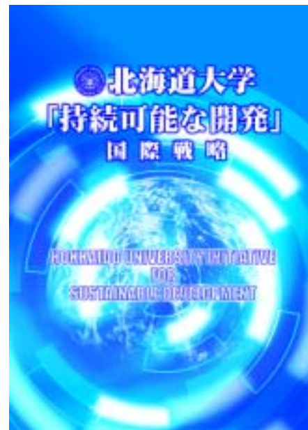
▲HUISD official pamphlet

We are expected to create a model for the university’s internationalization in the SD area by March 2010. The model is to lead subsequent projects in other areas.