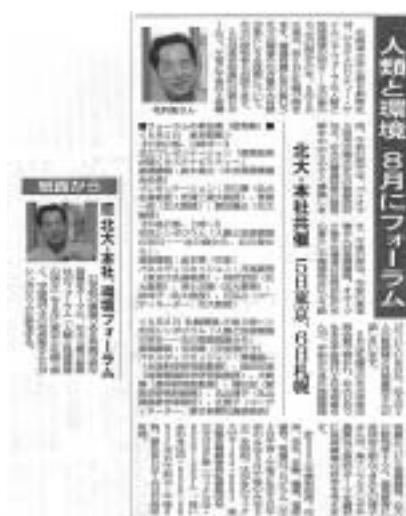
▲Asahi Shimbun (16/06/2006)

For further information: http://www.hokudai.ac.jp/huisd/en/taiwa.html