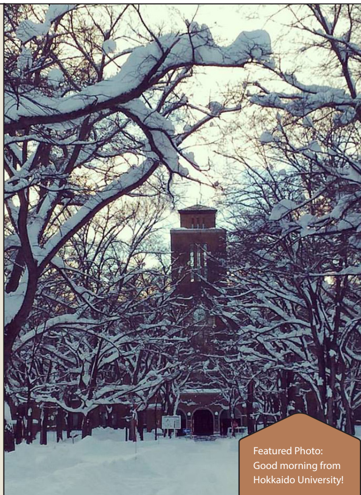
Featured Photo: Good morning from Hokkaido University!

This summer between May 29 th and September 1 st , more than 140 researchers worldwide are being invited to teach around 100 courses. Applications to join the HSI are now being accepted until the 28th of February. Don't miss out on this unique opportunity! You need only be a current student of a university to apply. For more information, please visit the HSI website here .